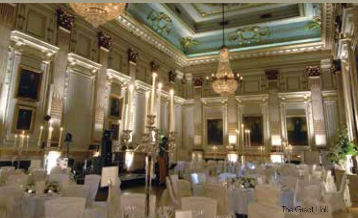
The Great Hall